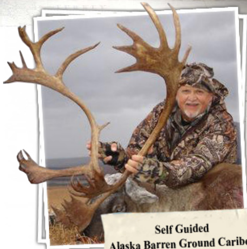
Self Guided Alaska Barren Ground Caribou

*each hunter is limited to 70#'s of gear excluding the weight of your rifle